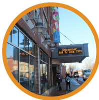
INTEGRATED ARTS & MANAGEMENT