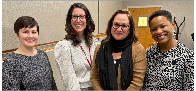
Early Childhood professionals shared their expertise during EASTCONN's 9th Annual Infant/Toddler Conference held in Hampton.

The 9th Annual Infant/Toddler Conference took place in early March at EASTCONN's Conference Center in Hampton. "Building Strong Relationships Between Families, Caregivers and Staff Members" provided 115 participants with shared learning around the implementation of the Strengthening Families Protective Factors Framework. Strategies for partnering with parents, ideas for structures and engagement, and many other opportunities and challenges to ensure the programs' value and support of all families were presented.