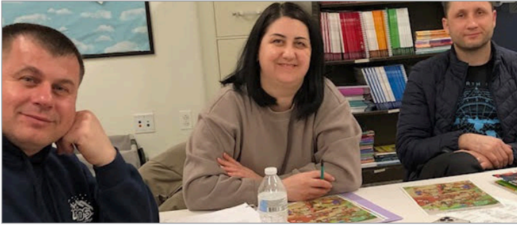
Ukrainian and Russian students study English together at EASTCONN's Northeast Learning Center in Danielson.