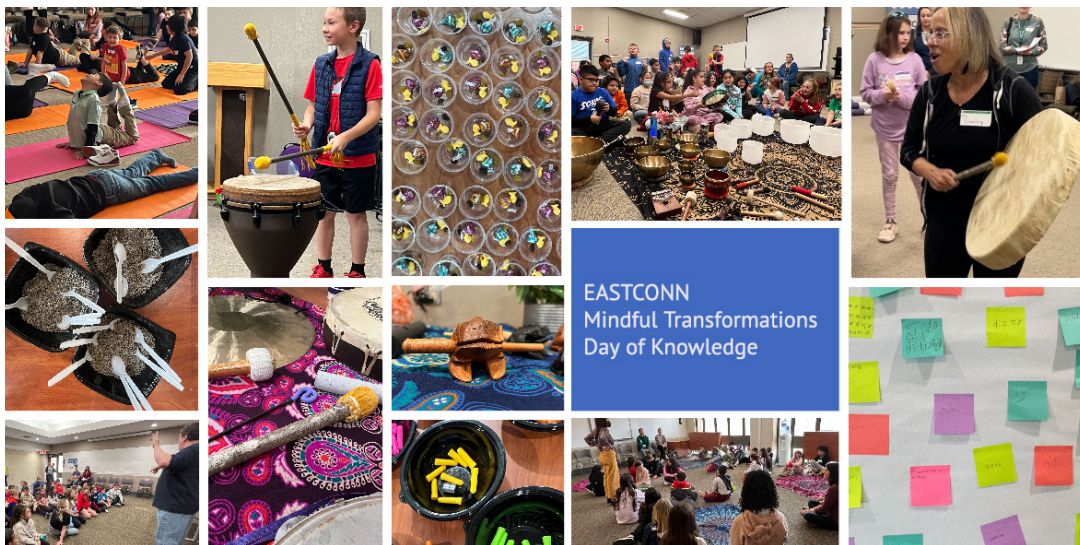
EASTCONN Mindful Transformations Day of Knowledge